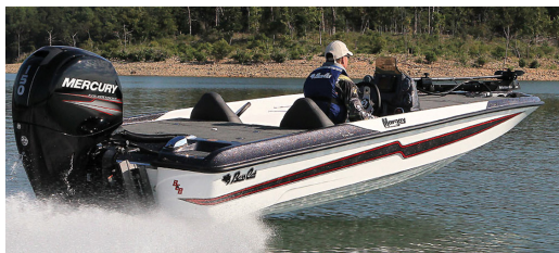
17' 7" Bass Cat Margay Vision Boat & Trailer Donated by Bass Cat Boats of Mountain Home, AR